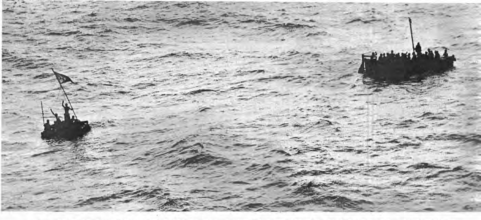
Survivors of the torpedoed tanker SS Elizabeth Kellogg await rescue in a lifeboat and tiny raft in the Caribbean Sea near the Canal Zone.