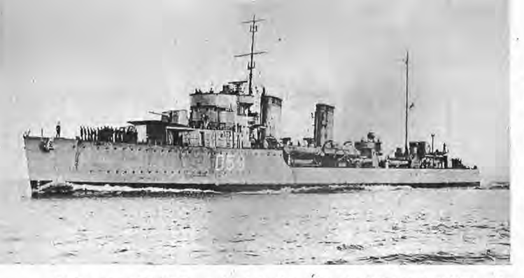
This is a picture of HMCS Skeena taken during the early months of the Second World War. The ship's company, so thoroughly "maligned" in the accompanying article, was good enough to share with their compatriots of the corvette Wetaskiwin in the sinking of U-588 on July 31, 1942—the RCN's third U-boat kill of the war. (N-1)