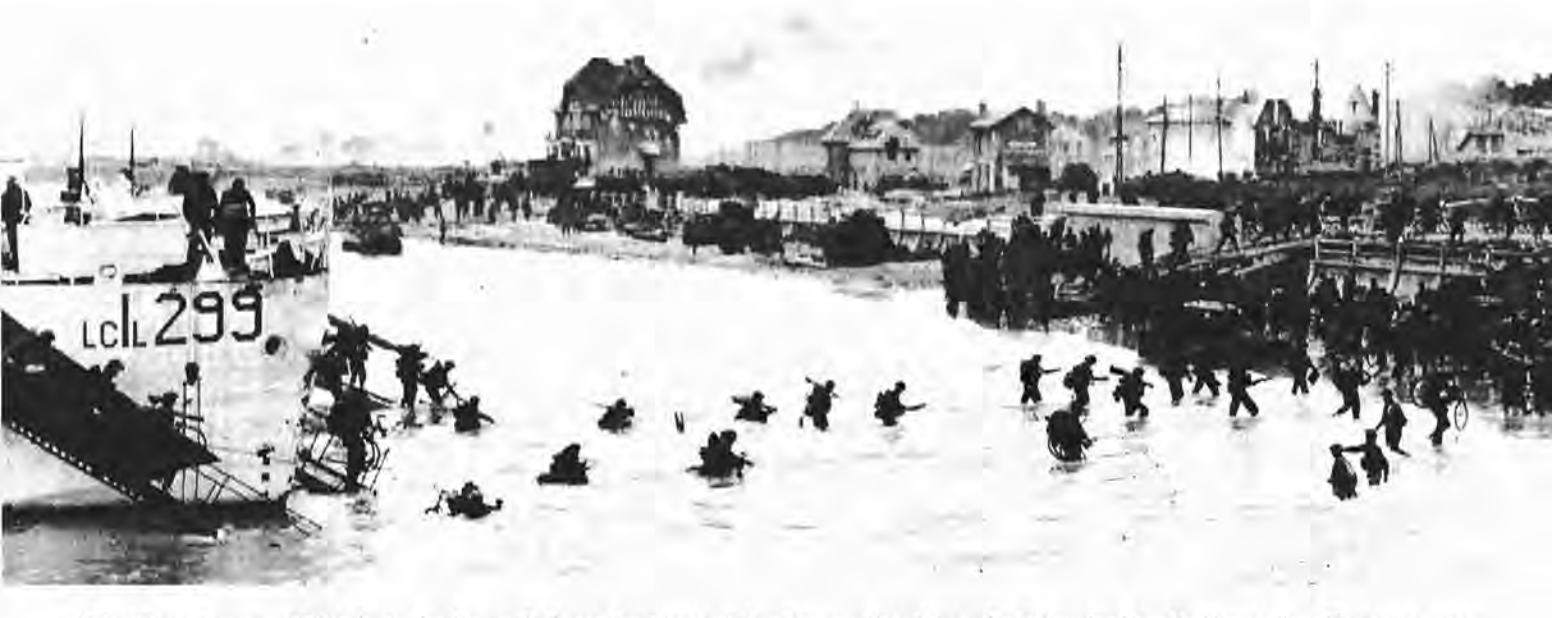
This picture shows an RCN infantry landing craft disgorging troops at Bernières-sur-Mer during the D-Day landings in Normandy. The same scene appears in "Invasion—The D-Day Story in Pictures", reviewed here. (GM-2243)