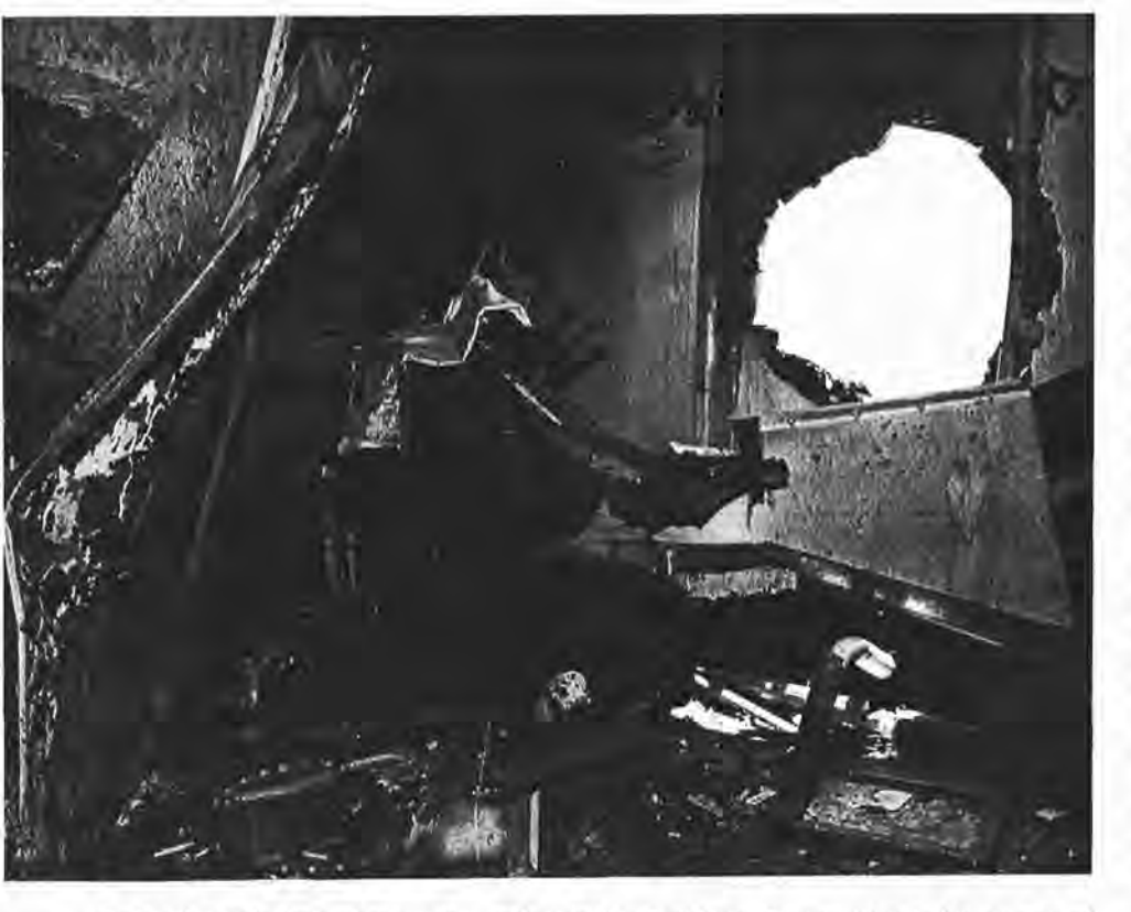
During the early days of submarine warfare in the Caribbean, German U-boats felt so sure of their safety from attack that they frequently shelled ships instead of using torpedoes. Some of the damage done to the SS Esso Bolivar in March 1942 during a gunfire attack in the Windward Passage is shown. The master and six crew members were killed but the ship made port at Guantanamo, Cuba. (Official U.S. Navy Photo.)

fishing party in a small motor launch, were blown about 20 feet in the air. They escaped with minor injuries and a minesweeper brought down from San Juan exploded a total of six mines while thousands of St. Lucians watched the show and rushed out in small boats to pick up the dead fish.